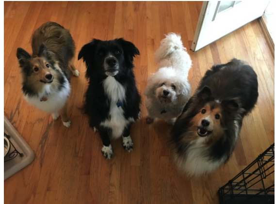
Fynn, Oreo, Snowball, Tango